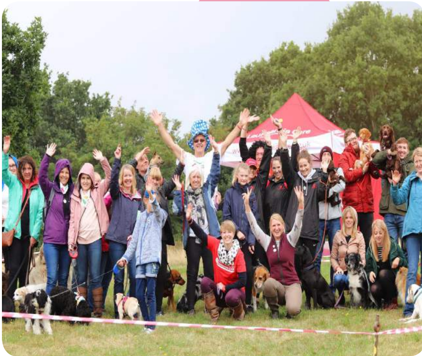
Pictured: Our Malvern spotty dog walkers enjoying the event in 2018

For the past two years, dog walkers in Malvern have been involved in our spotty dog event including a walk and dog competition.